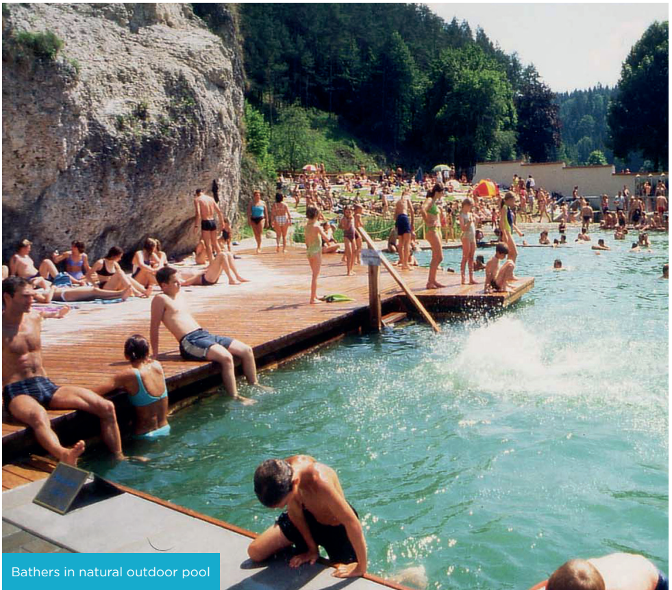
Bathers in natural outdoor pool

The Wapping Lido aims to use part of Shadwell Basin to create a 50 metre-long swimming pool, with changing rooms and a new café/restaurant.